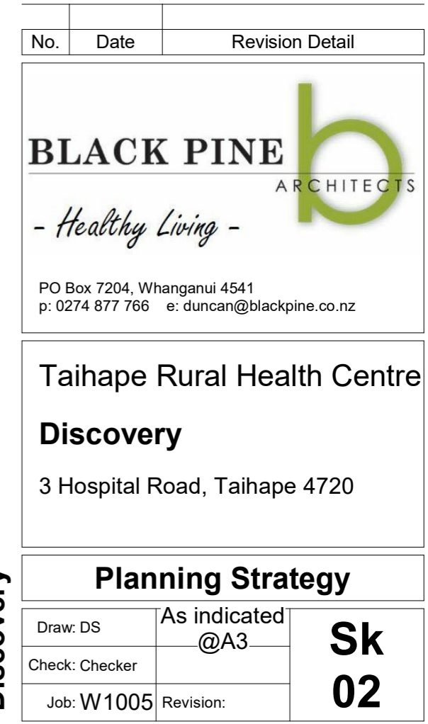
Ground - Proposed Layout - Planning